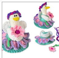
Mini Fairy Dress Up Set