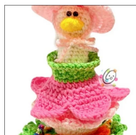
Mini Goose Spring Dress U...