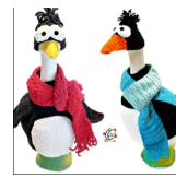
Penguin Goose Pack