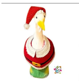
Goose Holiday Suits