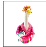
Midlife Marge Goose Set