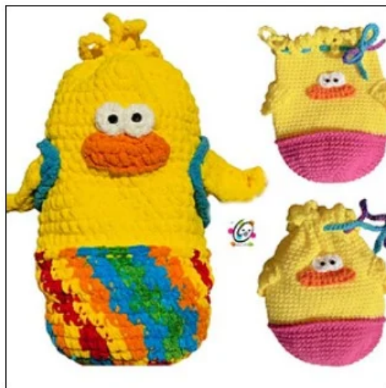
Tag Along Bags