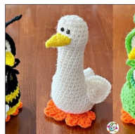
Mini Dress Up Goose