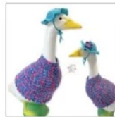
Spring Goose Set