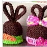
Fudgy Wiggle Ears