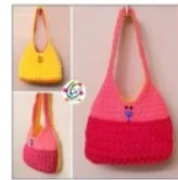
Little Girl's Spring Purse