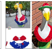
Flirty Goose Set