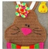
Bunny Ears Decor