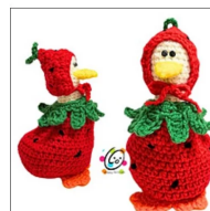
Mini Goose Berry Dress Up...