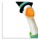
Snowman Goose Set