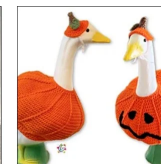
Pumpkin Goose Set