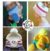
Cotton Tail Beanies