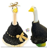
Party Going Goose

offer ends 3/31/24 - no coupon needed. Discount applied in the cart