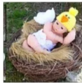
Cracked Egg Set