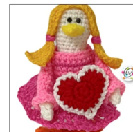
Mini Goose Sweet Dress U...