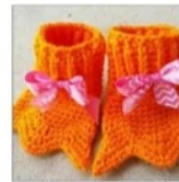
Big Quacky Slippers