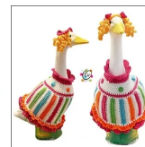
Snappy Goose Dress