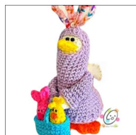
Mini Goose Bunny Dress U...