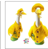
Rainy Day Goose Set