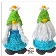
Mini Gnome Dress Up Set