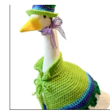
Lucky Goose Set