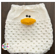
Mini Goose Laundry Bag