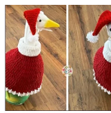
Winter Goose Sweater