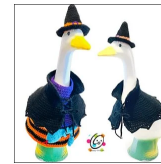
Witch Goose Costume