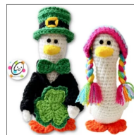
Mini Goose Lucky Dress Up...