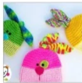
Rebel Rabbit Hat