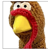
Turkey Disguise Hood