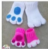
Bunny Feet Slippers