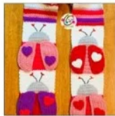
Spring Sampler Scarf