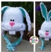
Cla is a bunny and snowman