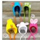
Spring Critter Bonnets